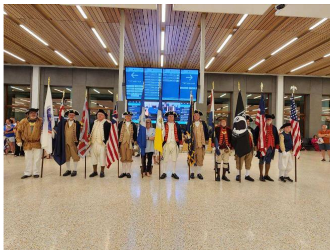
The MOSSAR and the KSSAR Color Guard at the KCI Honor Flight.