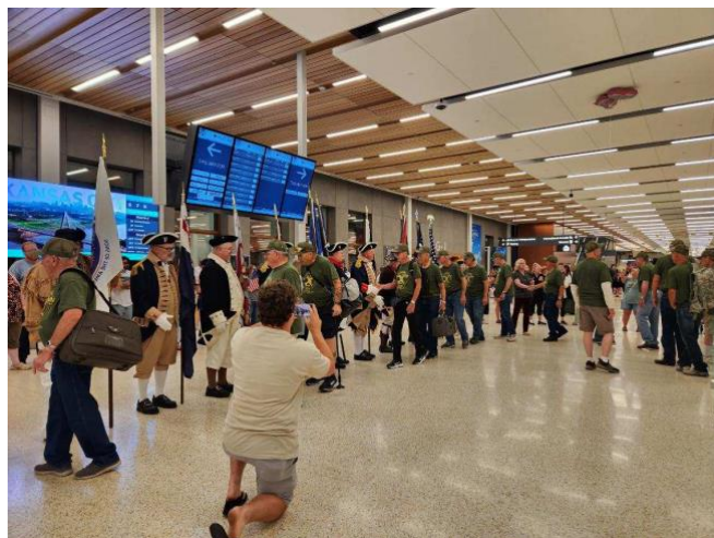
Returning Veterans are welcomed the MOSSAR and KSSAR Color Guards.