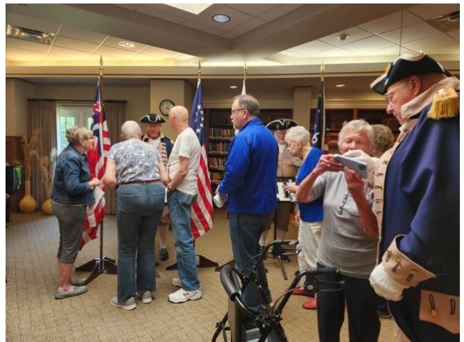
The Delaware Crossing Color Guard visit with residents of the Cedar Lake Village.