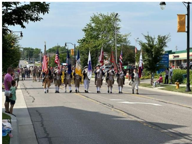
The KSSAR Color Guard at the Old Shawnee Days Parade.