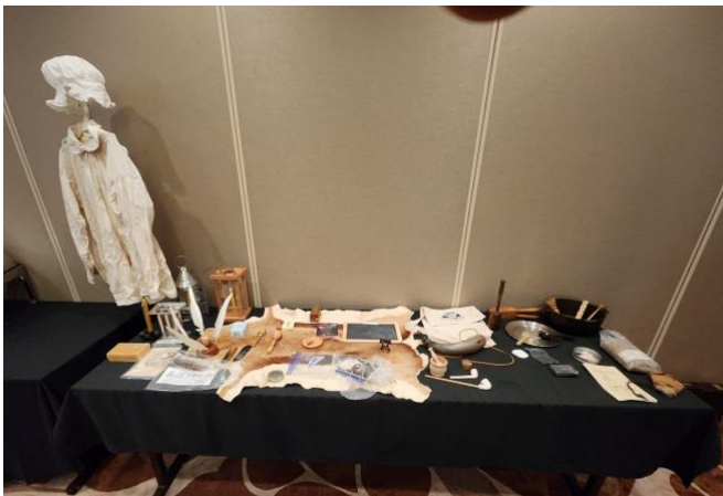
The contents of the Delaware Crossing Patriot Chests.