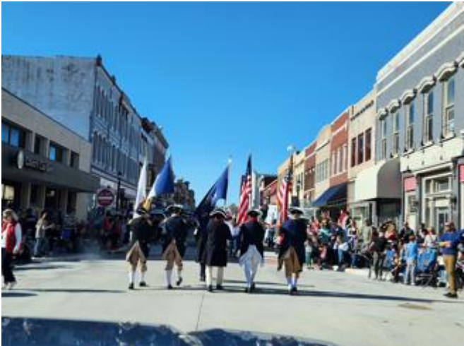
The Colors carried by the KSSAR Color Guard.