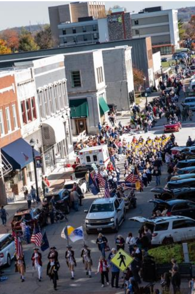
The KSSAR Color Guard in the Leavenworth Veteran's Day Parade.