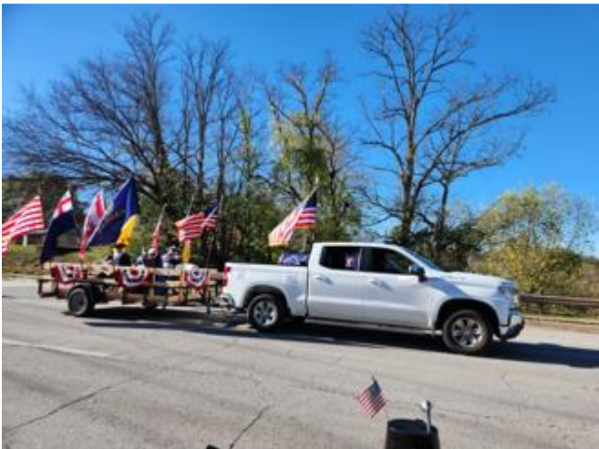
The Delaware Crossing Color Guard Float.