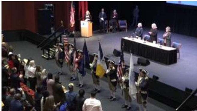
Kansas Color Guard at the March 13 th Naturalization Ceremony