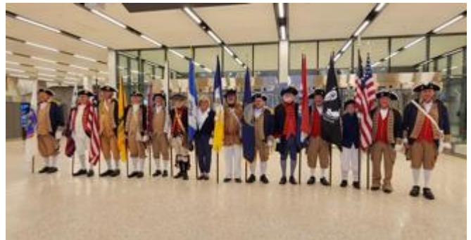
MOKAN Color Guard at the March 29 th Honor Flight.