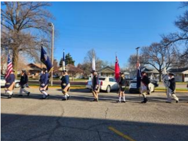
Kansas Color Guard advancing the Colors.