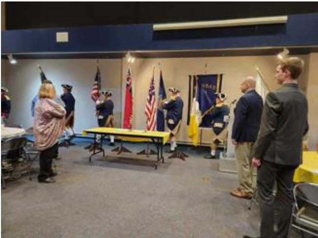
Kansas Color Guard at the State Conference.