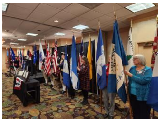
GWBC Color Guard.