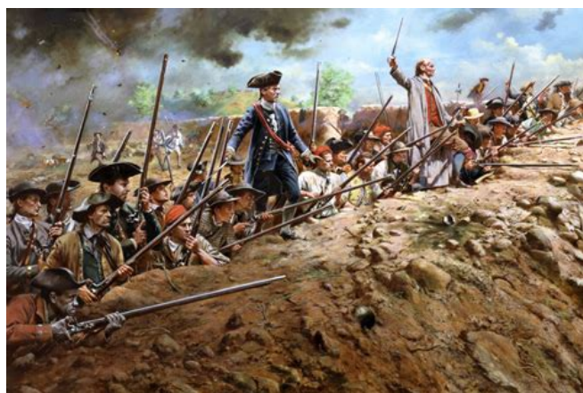
The Battle of Bunker Hill