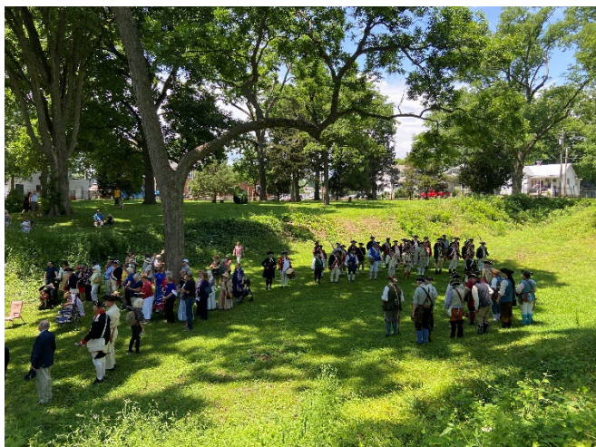
The SAR musket and rifle men exchanged a three-volley salute with the French Milice contingent

The SAR participates in various events throughout the year. These include grave markings, parades, DAR events, civic events, Naturalizations of new citizens, and Honor Flights. Yes, the Color Guard members Present the Colors or march out in front of a vehicle and trailer. However, all members are welcome to attend and support the event. If it is a parade, then members can ride in the truck or on the decorated trailer to show attendees there are more in the SAR than just a few men in uniform carrying flags.