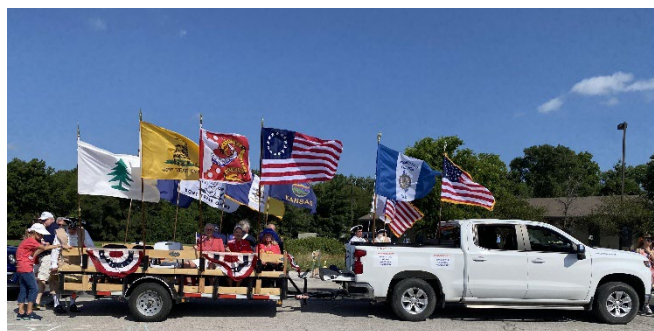
Truck and decorated trailer for parade riders