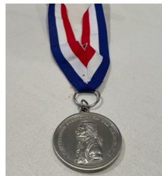
Commemorative Lewis & Clark coin