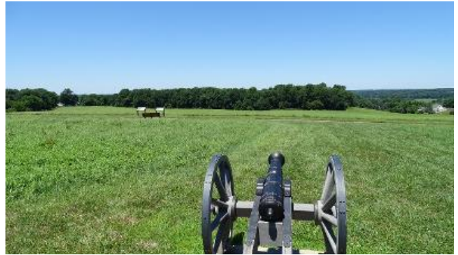
View of Sandy Hollow Battlefield.