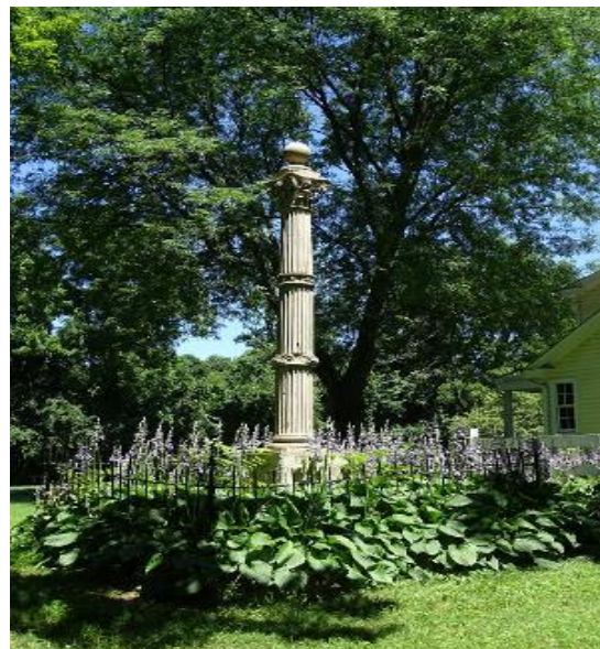
Lafayette Wounding Monument.