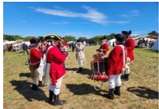
British Fife and Drum.