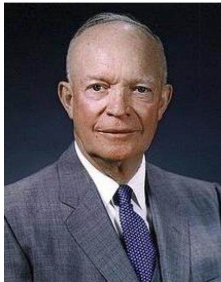
8 Compatriot Eisenhower, 34th President of the United States

The Kansas SAR invites all SAR, DAR, and CAR chapters, patriotic and veterans organizations to participate by laying a wreath outside the Place of Meditation during the ceremony. The public is invited to attend this special ceremony honoring President Eisenhower's membership in the SAR as part of the celebration of D-Day.