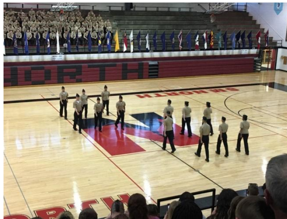
6 Cadet drill team show precision moves at SMNHS gym.