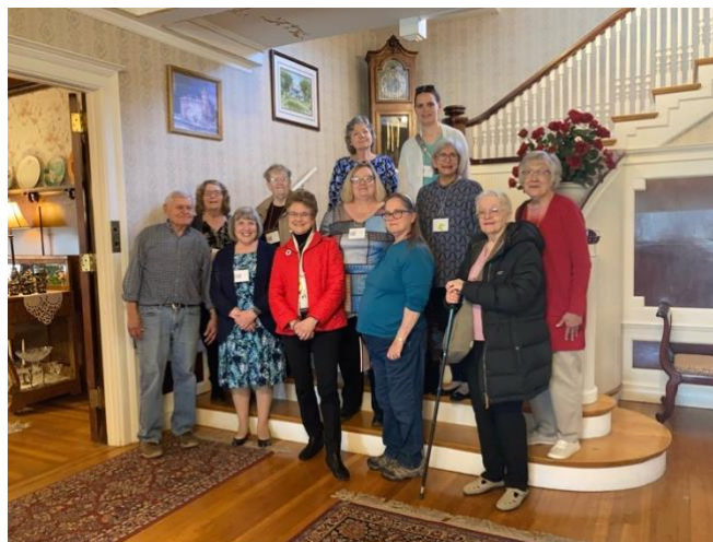
KSSAR Conference attendees' wives at the Seelye Mansion.