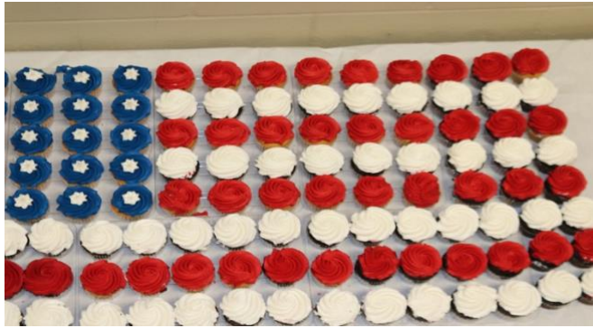
Pat Fry creatively arranged the cup cakes as an American Flag.