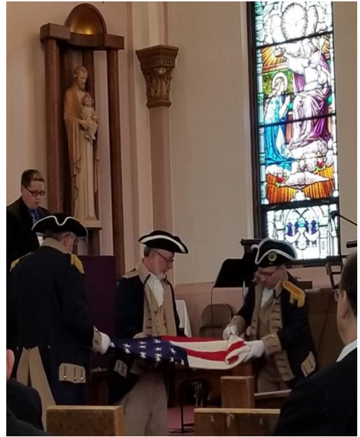
Flag folding ceremony during the KSSAR Memorial Service.