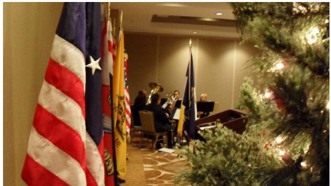
3 American Legion Band.