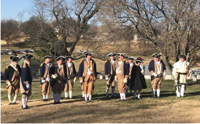
4 SAR color guard at Wreaths Across America

Wreaths were placed on veteran graves at the National Cemetery in Leavenworth, Kansas on Dec 16, 2017.