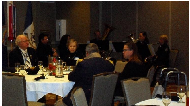
2 President's table at the dinner.

The chapter Christmas Party was held at the Hilton Garden Inn on December 9, 2017. The American Legion Band played Christmas selections during the party. The dinner was buffet style, with main entrée of Lasagna or chicken DeBurgo.