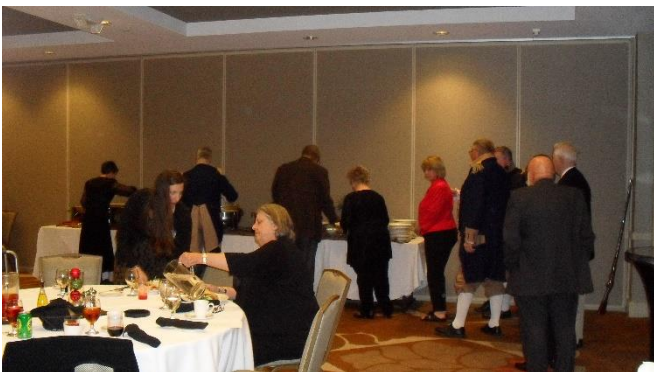
1 Dinner is served.