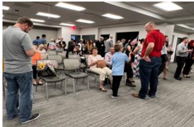
New U.S. Citizens and their Families.