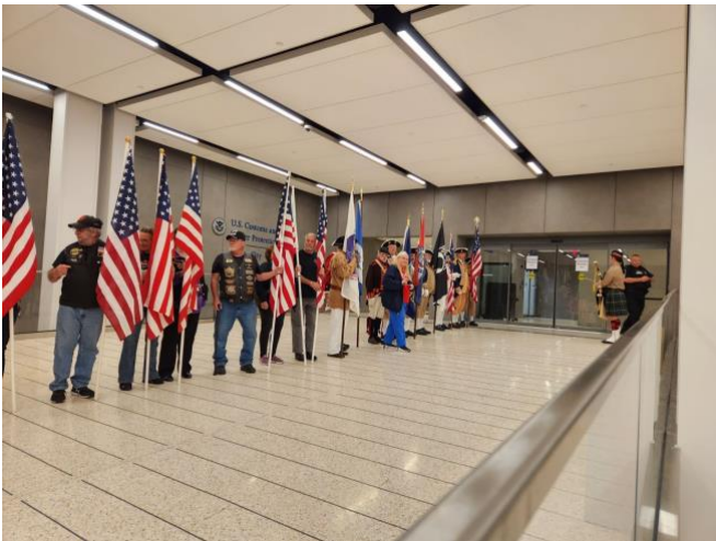
The Patriot Guard Riders and the KSSSAR / MOSSAR Color Guard.

arrive at 8:40 PM on Friday November 10. It will thrill your heart to see the smile and tears on the faces of the Veterans when they see the Color Guard, then the crowd welcoming them home and thanking them for their service.