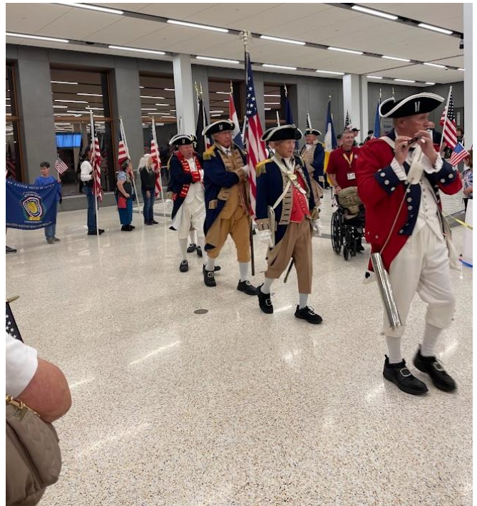
The Color Guard follows the Veterans through the Airport.