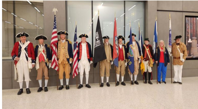
MOSSAR and KSSAR Color Guard at the Kansas City International Airport.

Facebook at Delaware Crossing Chapter-KSSAR