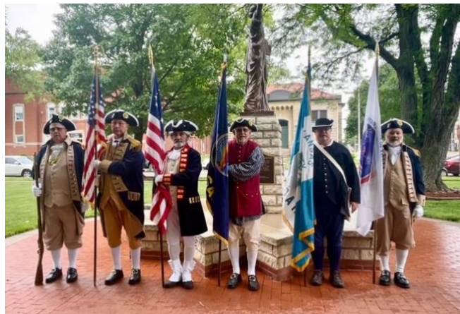
KSSSAR Color Guard at the "DAR America 250 Our Patriots Marker".

NOTE: The medals may be awarded to deserving non-SAR members as part of our Partners in Patriotism program, such as members of the Daughters of the American Revolution.