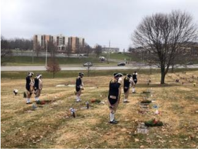
The KSSAR Color Guard ceremonially laying wreaths.