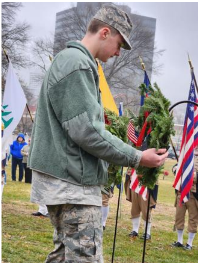
A Student Cadet places a wreath for a Branch of the Armed Forces.