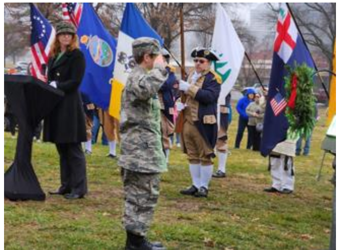
A Student Cadet salutes the Branch of the Armed Forces for which he has placed a wreath.