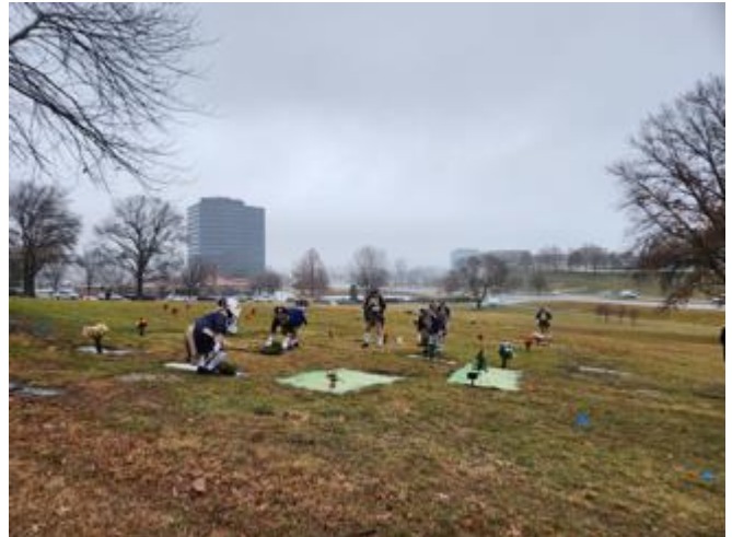
KSSSAR Color Guard places wreaths on Veteran's graves.