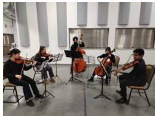
The Blue Valley High School Stringed Quintet.