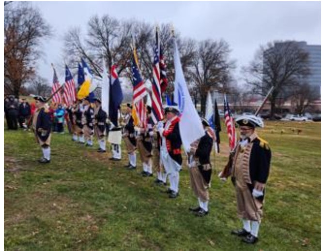
KSSAR Color Guard.