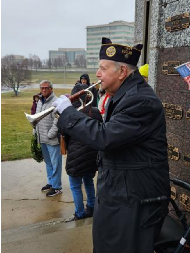
Taps is played by a Veteran Bugler.