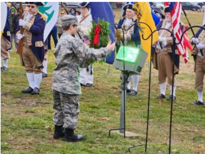
A Student Cadet places a wreath for a Branch of the Armed Forces.