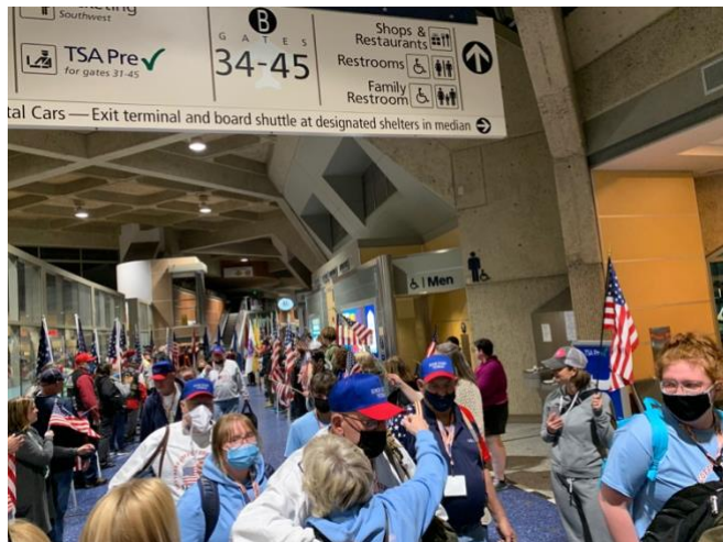
Honor Flight Veterans and Family at KCI.