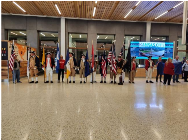
The combined MOSSAR and KSSAR Color Guard at the May 25 th Honor Flight.