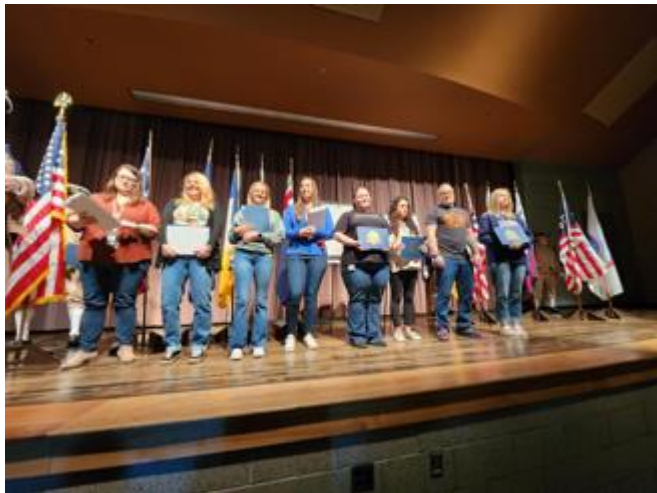
The Fifth Grade Teachers of the Pioneer Ridge Middle School.