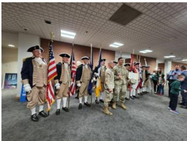
Photo of new U.S. Citizens with the KSSSAR Color Guard.