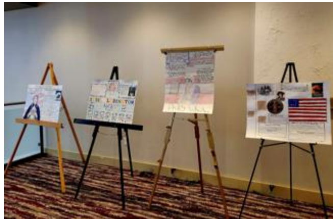
The four State Poster Contest entries.

We are blessed to have officers, committee chairmen and compatriot members who support these efforts and keep the chapter at the forefront of achievement within the KSSAR.