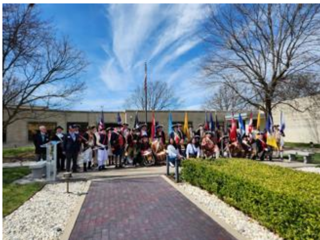
MOSSAR and KSSSAR Color Guard at the Truman Library.